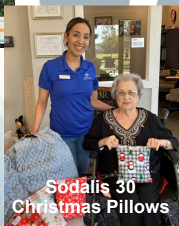
Sodalis 30 Christmas Pillows