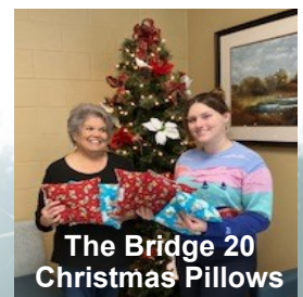
The Bridge 20 Christmas Pillows