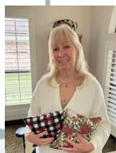
Parsons House 15 Christmas Pillows

PILLOW MINISTRY UPDATE Our Ladies meet Tuesday mornings from 9:00 to 11:00 for Devo, Prayers & Pillows Come Join!