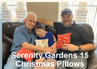
Serenity Gardens 15 Christmas Pillows