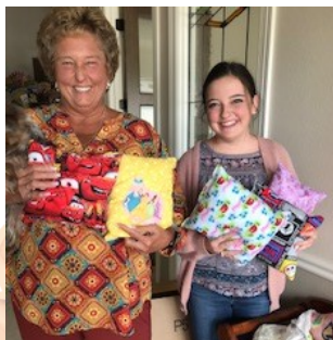
Project Joy & Hope Staff

PILLOW MINISTRY Our Pillow Ministry provided "Comfy Pillows" for 10 boys and 10 girls at The Joy & Hope Project which is a "home away from home" for children who are undergoing treatment, need palliative care or need to recover from transplant.