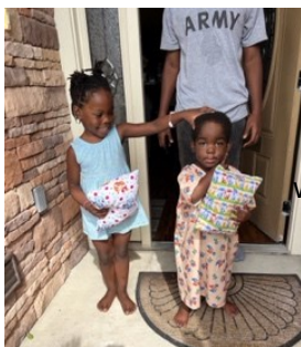
Family is from Uganda. Three year old sister gave brother bone marrow transplant.