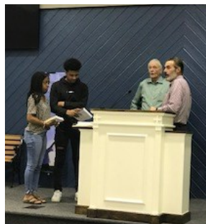
Bible Presentation and Celebration Luncheon was 5/7/23 CONGRATULATIONS GRADS!